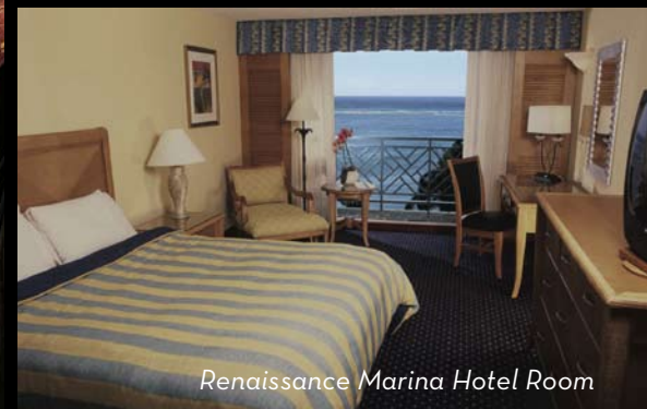
Renaissance Marina Hotel Room

The Marina Hotel features 301 welcoming guest rooms with either one king bed or two double beds. Each room offers a French balcony, high-speed Internet, mini bar, and more. Guests may choose from either sweeping views of the ocean, Oranjestad, or the hotel atrium overlooking the unique water launch. The Ambassador Suite showcases a living room with distinctive furnishings, the charm of a French balcony, high-speed Internet, and an amazing 42" high-definition plasma television.