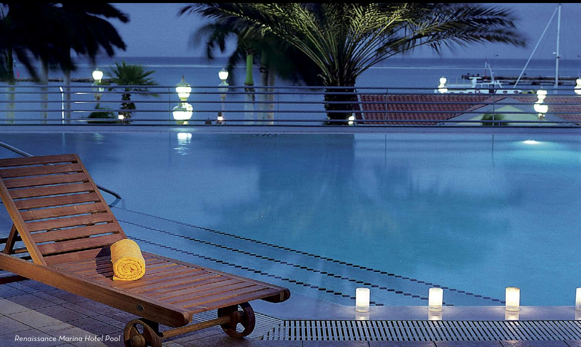
Renaissance Marina Hotel Pool