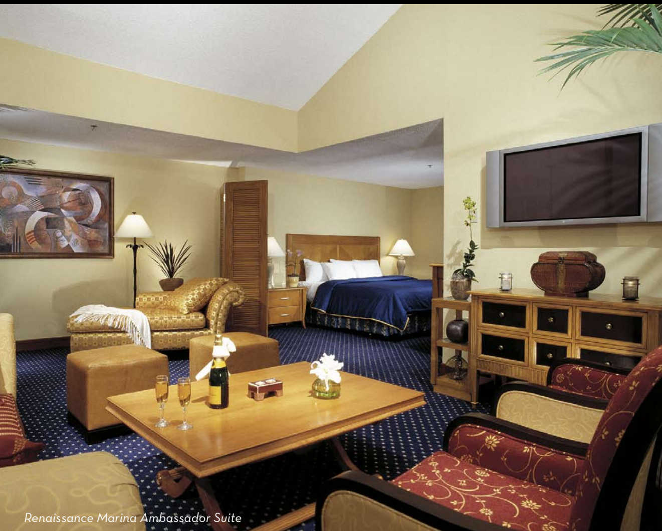
Renaissance Marina Ambassador Suite

The Marina Hotel features 301 welcoming guest rooms with either one king bed or two double beds. Each room offers a French balcony, high-speed Internet, mini bar, and more. Guests may choose from either sweeping views of the ocean, Oranjestad, or the hotel atrium overlooking the unique water launch. The Ambassador Suite showcases a living room with distinctive furnishings, the charm of a French balcony, high-speed Internet, and an amazing 42" high-definition plasma television.