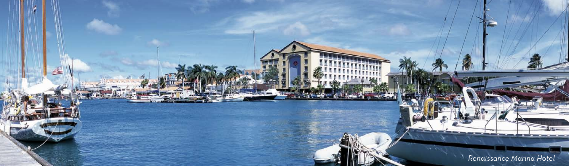
Renaissance Marina Hotel