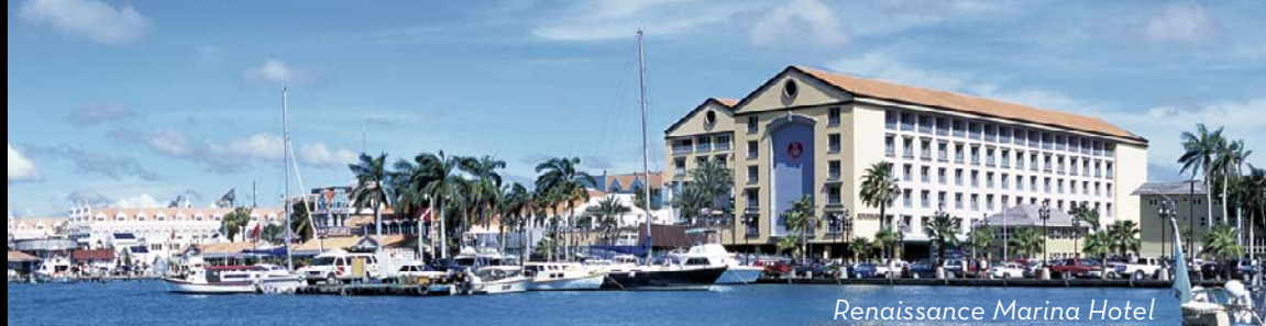
Renaissance Marina Hotel