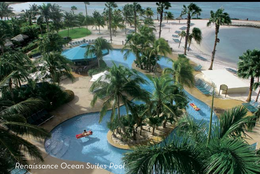
Renaissance Ocean Suites Pool