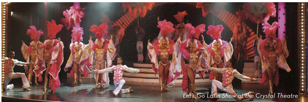
Let's Go Latin Show at the Crystal Theatre

Visitors can browse or buy at over 100 shops and boutiques, all within the Renaissance Marketplace and Mall. Their guests will find designer fashions, accessories, fragrances, jewelry and one-of-a-kind souvenirs.