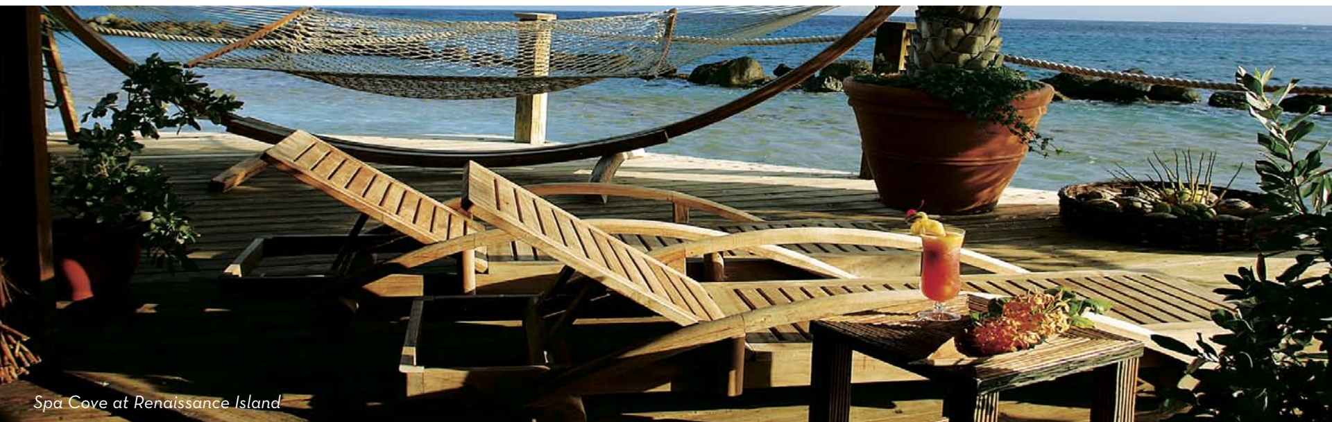
Spa Cove at Renaissance Island

The year-round children's program, Patamingo Kids Club, for children ages 5 to 12, features day and evening sessions with fun-filled activities. Baby sitting services are also available.