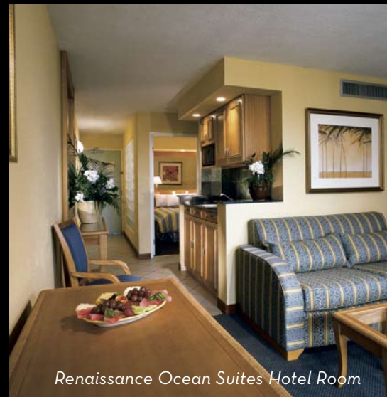
Renaissance Ocean Suites Hotel Room

The Ocean Suites features 258 spacious one-bedroom suites. Each offers a king bed, large bathroom, and living room with queen sofa bed. Amenities include a wet bar with fridge, mini bar, microwave, high-speed Internet, and a balcony or patio. Guests can choose from stunning ocean and pool views or lovely park and marina views.