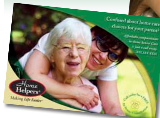
Direct Mail Postcards