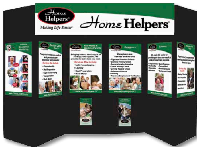
Trade Show Display